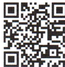
Junior and Senior HS