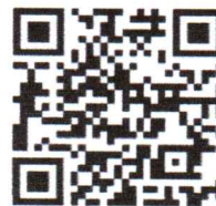
Junior and Senior HS