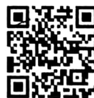
Junior and Senior HS