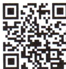
Junior and Senior HS